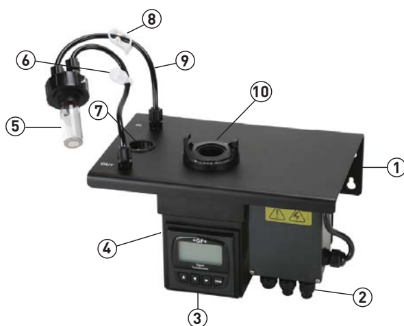
Signet 4150 Turbidimeter